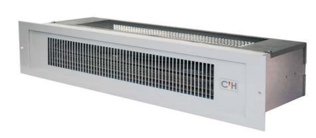
RDH Electric Recessed Over Door Heater