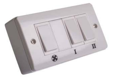
Remote Switch Unit